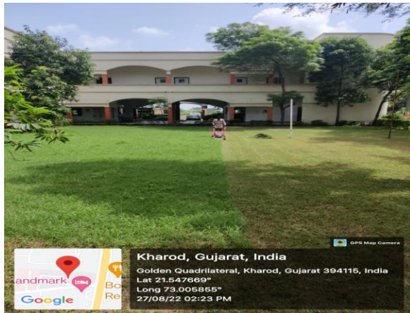
# Maintenance of Garden