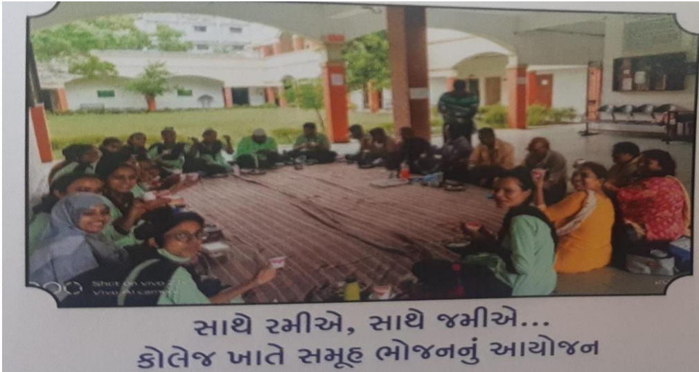
સાથે રમીએ, સાથે જમીએ... કોલેજ ખાતે સમૂહ ભોજનનું આયોજન