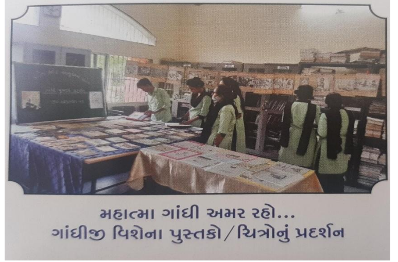
મહાત્મા ગાંધી અમર રહો... ગાંધીજી વિશેના પુસ્તકો/ચિત્રોનું પ્રદર્શન