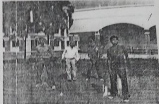
PHOTOGRAPHS OF THE INSTITUTION